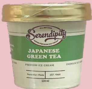
Japanese Green Tea