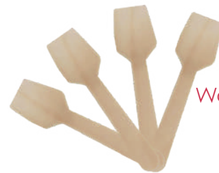
Wooden Spoons 1000pcs