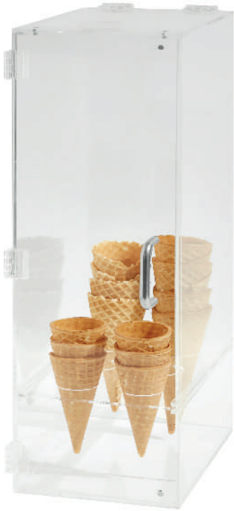
Cone Dispenser X 4