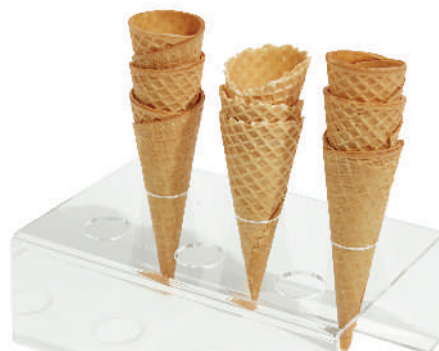
Cone Holder 6 Also Available in 3