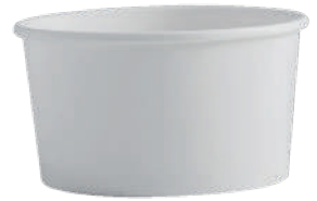
8oz/250ml White Bio