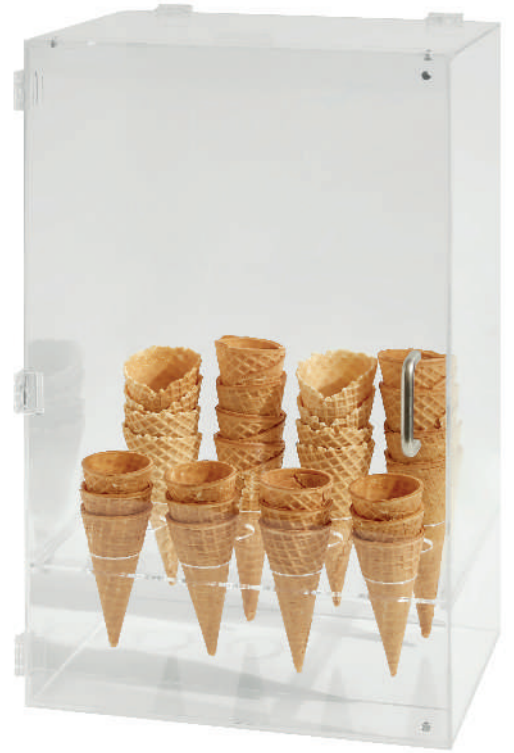
Cone Dispenser X 8