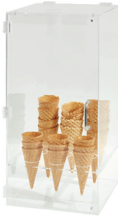
Cone Dispenser X 6