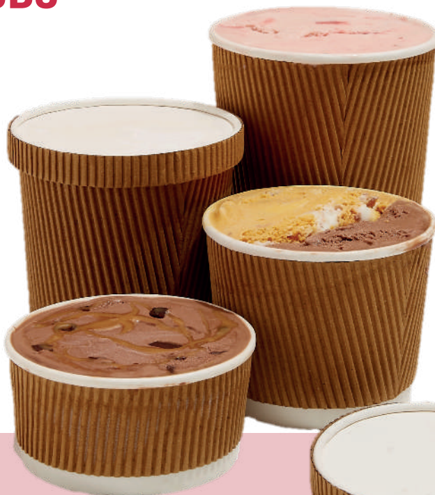
750ml Ripple Container with Lid