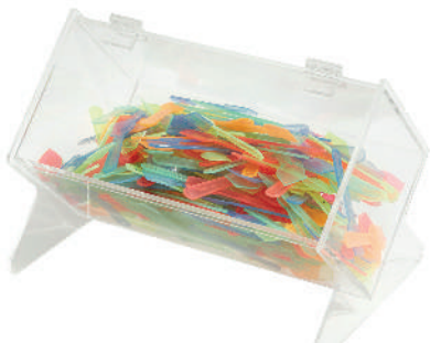
Spatulas & Scoops