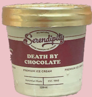
Death by Chocolate