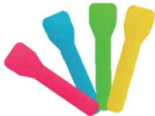
Paper Spoons 500pcs