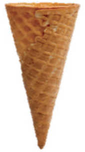
#7 Gluten Free Flat Waffle Top (128 x 50mm) 144 pcs