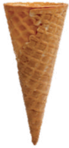
#1 Flat Top Waffle A (112 x 47mm) 360 pcs