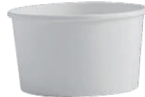
5oz/180ml White Bio