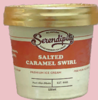
Salted Caramel Swirl